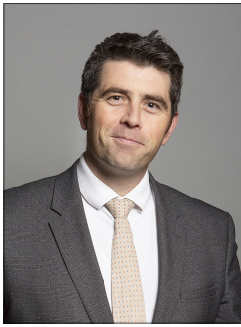
Scott Mann MP North Cornwall Constituency writes:

North Cornwall is home to small distilleries and larger breweries including Sharps, so the industry is at the very centre of our community, employing many people. The economic effects of fighting coronavirus last longer for businesses than the duration of any given restrictions, and we need to go further with our support. While I appreciate that lockdowns are unwelcome news for publicans, it is reassuring that the Chancellor has unveiled further economic support for businesses, including pubs. New one-off top-up grants have been announced, worth up to £9,000 per property, to help businesses through to the spring. For those businesses not eligible for the grants, a £594 million discretionary fund is being made available by the Government as a matter of urgency. The new one-off grants come in addition to billions of pounds of existing business support, including grants worth up to £3,000 for closed businesses, and up to £2,100 per month for impacted businesses once they reopen.